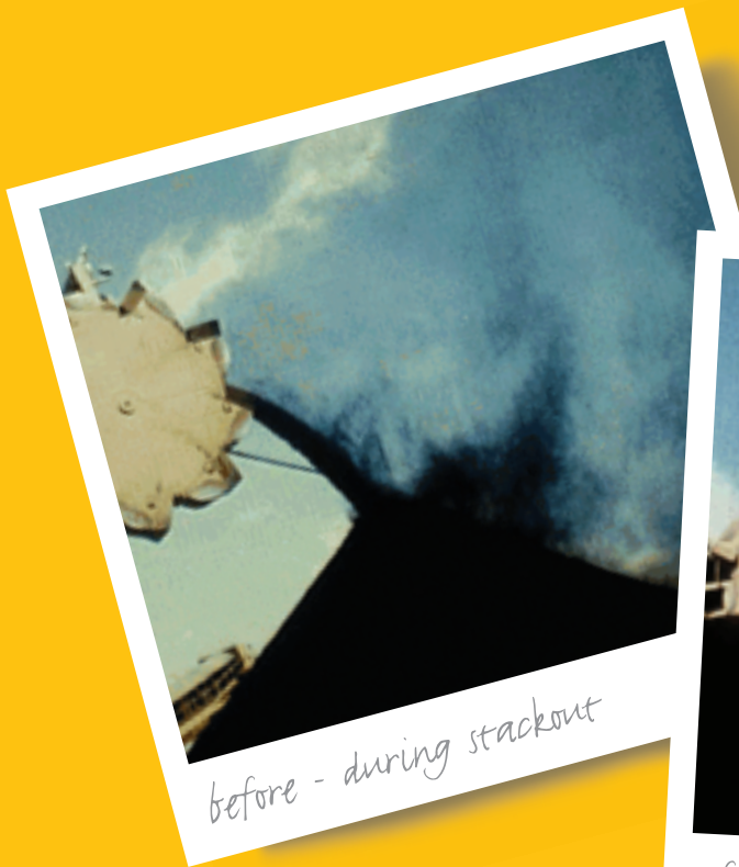
before - during stackout