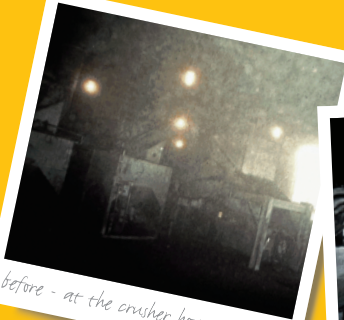
before - at the crusher house