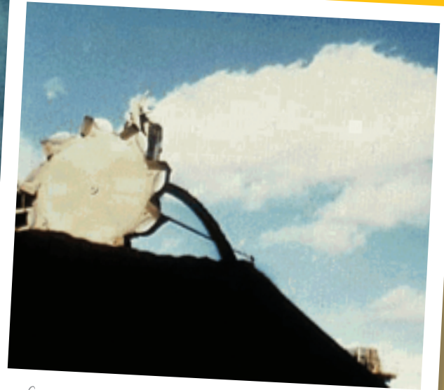
after - during stackout