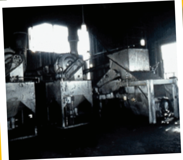
after - at the crusher house

Our system designers use only the latest and proven products and applications technology.